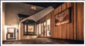
THEN & NOW Main image: Work gets underway Inset: The new entrance

Tuesday 13th of August marked one year since the commencement of the renovation works at the Three Eagles, Llangollen.