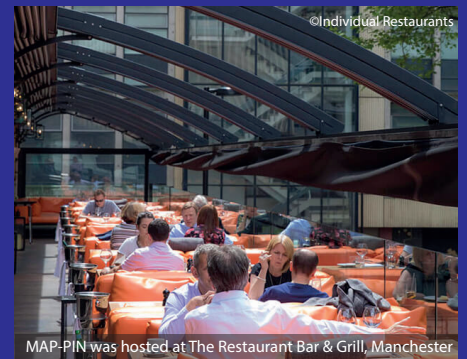
MAP-PIN was hosted at The Restaurant Bar & Grill, Manchester